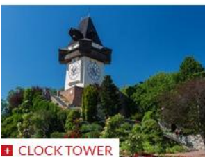
+ CLOCK TOWER