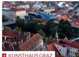
+ KUNSTHAUS GRAZ

Take the funicular, glass lift or zigzagging steps up the fortress hill for terrific city views.