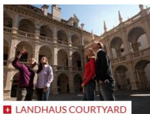
+ LANDHAUS COURTYARD

The world's largest collection of armour and weaponry – 32,000 items displayed in a 17th century building.