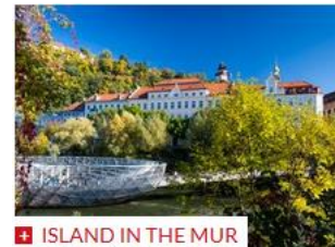
+ ISLAND IN THE MUR

Contemporary art in a blue-tinged, bubble-like building with 'nozzles', known as 'the friendly alien'.